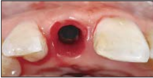
Fig 4a (left) Occlusal view showing the slightly labial positioning of the implant.