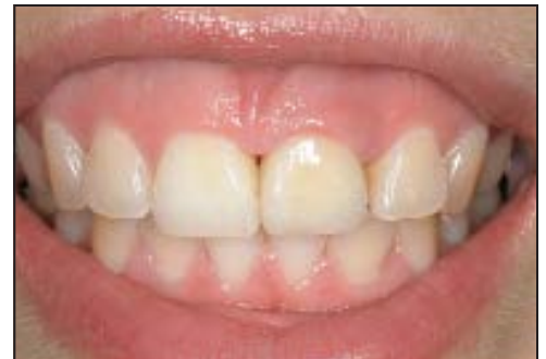
Fig 3c A pleasing outcome was achieved after implant restoration.

tissues will reequilibrate, and the normal pink coloration of the tissues will return. If the facial contour is not properly supported, a grayish hue will surface through the soft tissues under natural light. Therefore, it is recommended that the patient be brought under natural light to better evaluate the esthetics of the implant restoration prior to cementation.