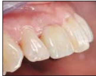
Figs 4c and 4d The abutment design reduces pressure on the soft tissues, thus achieving an esthetic outcome.

after surgical procedures, resulting in unesthetic outcomes. 24 In addition, selecting the right surgical technique to minimize tissue trauma is crucial for those patients. Procedures that may preserve soft and hard tissues around an implant, such as flapless surgery, 25 the papilla preservation technique, 26 and an esthetic buccal flap design, 27 should be considered. More importantly, implants have to be placed in a prosthetically acceptable position. 20 Negligence of the above-mentioned procedures may lead to esthetic failures.