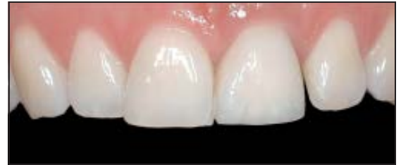
Figs 2b and 2c (below) Proper tissue support is achieved with the restoration.