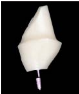
Fig 3a The emergence profile was designed to create a pronounced convex contour.