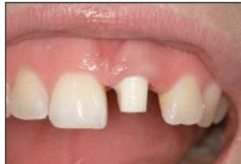
Fig 3b The soft tissues have been moved labially.